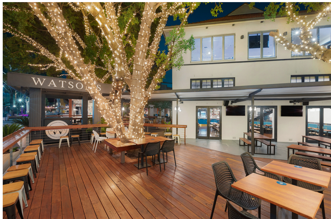
Cocktail area (up to 100 pax)

This space is available weather permitting