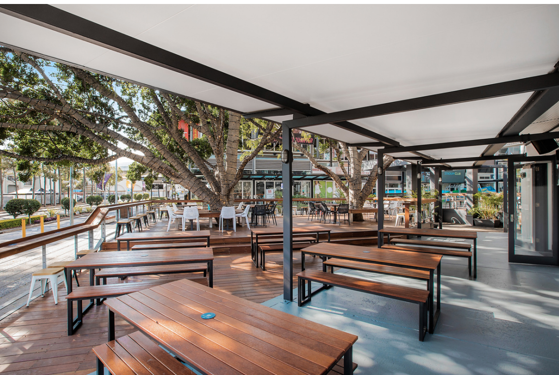
Seated area (maximum 40 pax)

One of our open-air decks in the beer garden underneath the fairy-lit fig trees, which come to life at dusk. Deck 1 is the best space for groups who are looking for a more casual style cocktail or seated event with the luxury of an undercover area.