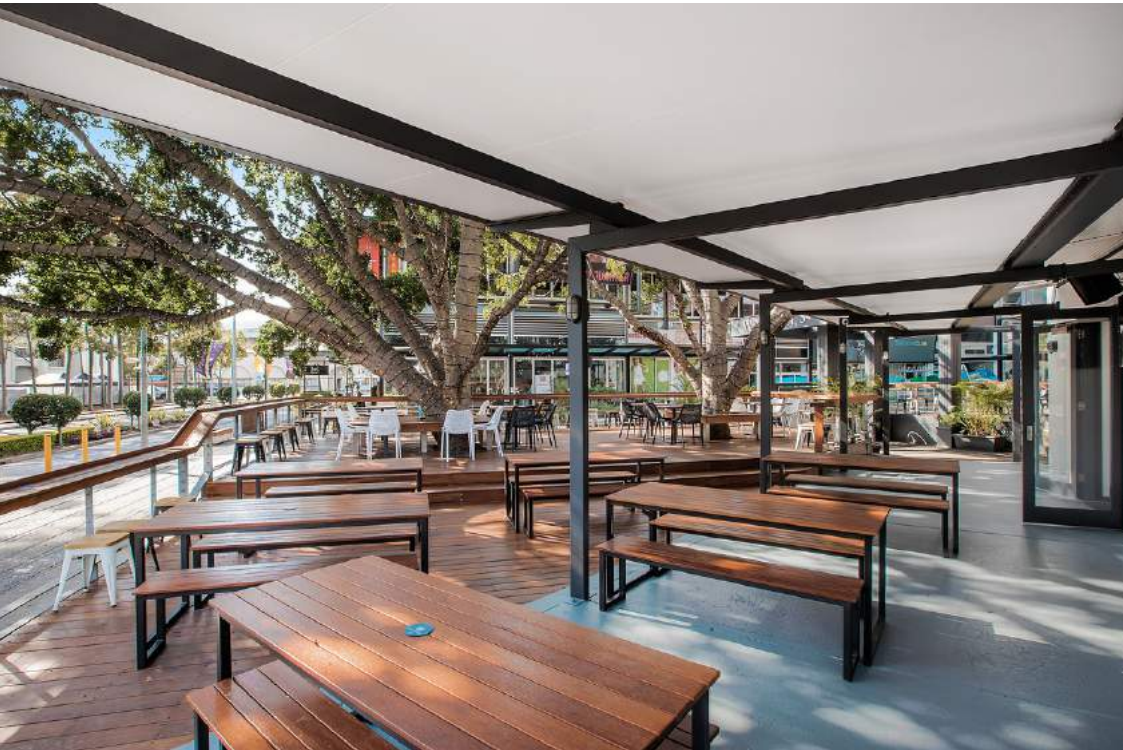
Seated area (maximum 40 pax)

One of our open-air decks in the beer garden underneath the fairy-lit fig trees, which come to life at dusk. Deck 1 is the best space for groups who are looking for a more casual style cocktail or seated event with the luxury of an undercover area.