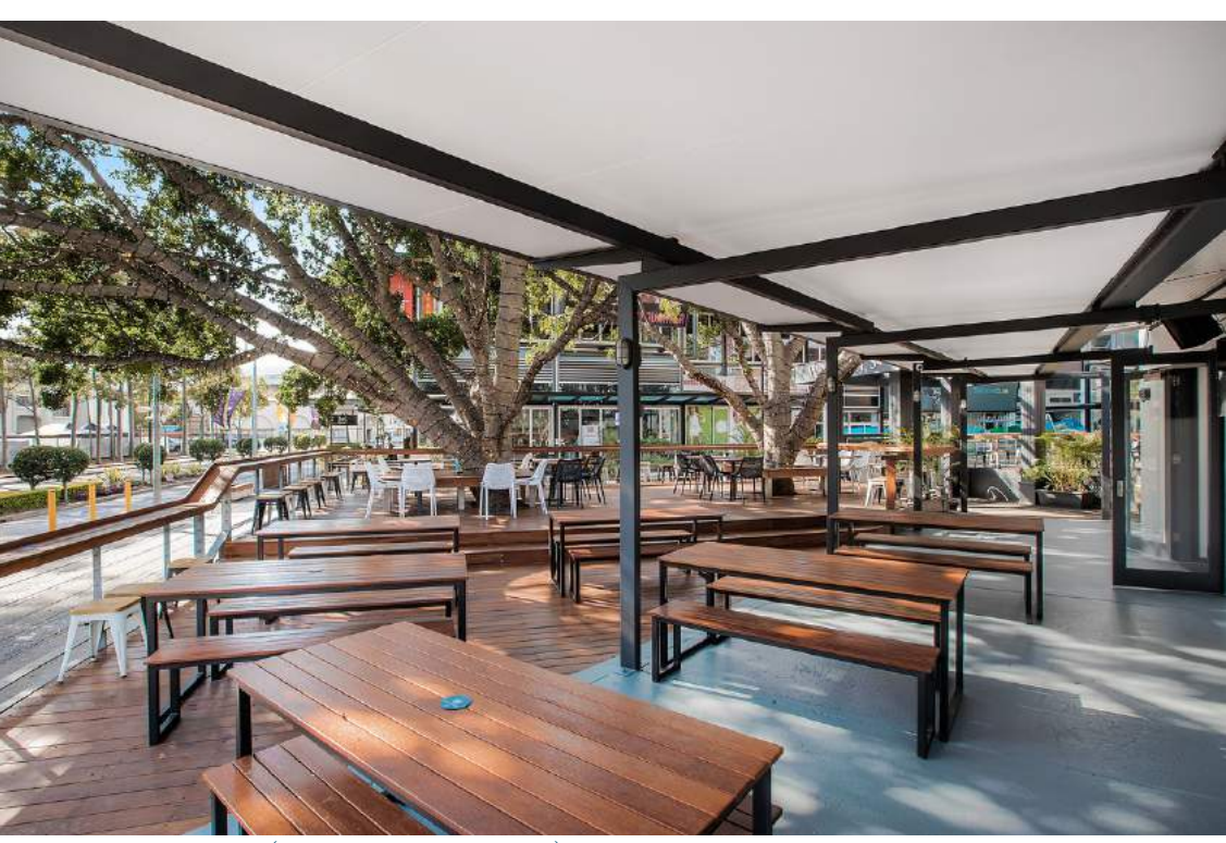
Seated area (maximum 40 pax)

One of our open-air decks in the beer garden underneath the fairy-lit fig trees, which come to life at dusk. Deck I is the best space for groups who are looking for a more casual style cocktail or seated event with the luxury of an undercover area.