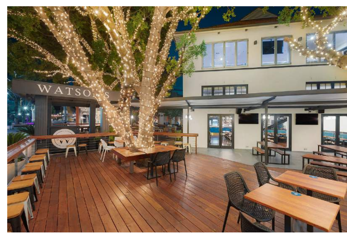
Cocktail area (up to 100 pax) This space is available weather permitting