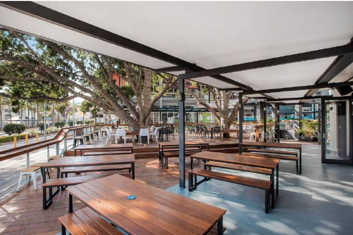
Seated area (maximum 40 pax)

One of our open-air decks in the beer garden underneath the fairy-lit fig trees, which come to life at dusk. Deck 1 is the best space for groups who are looking for a more casual style cocktail or seated event with the luxury of an undercover area.