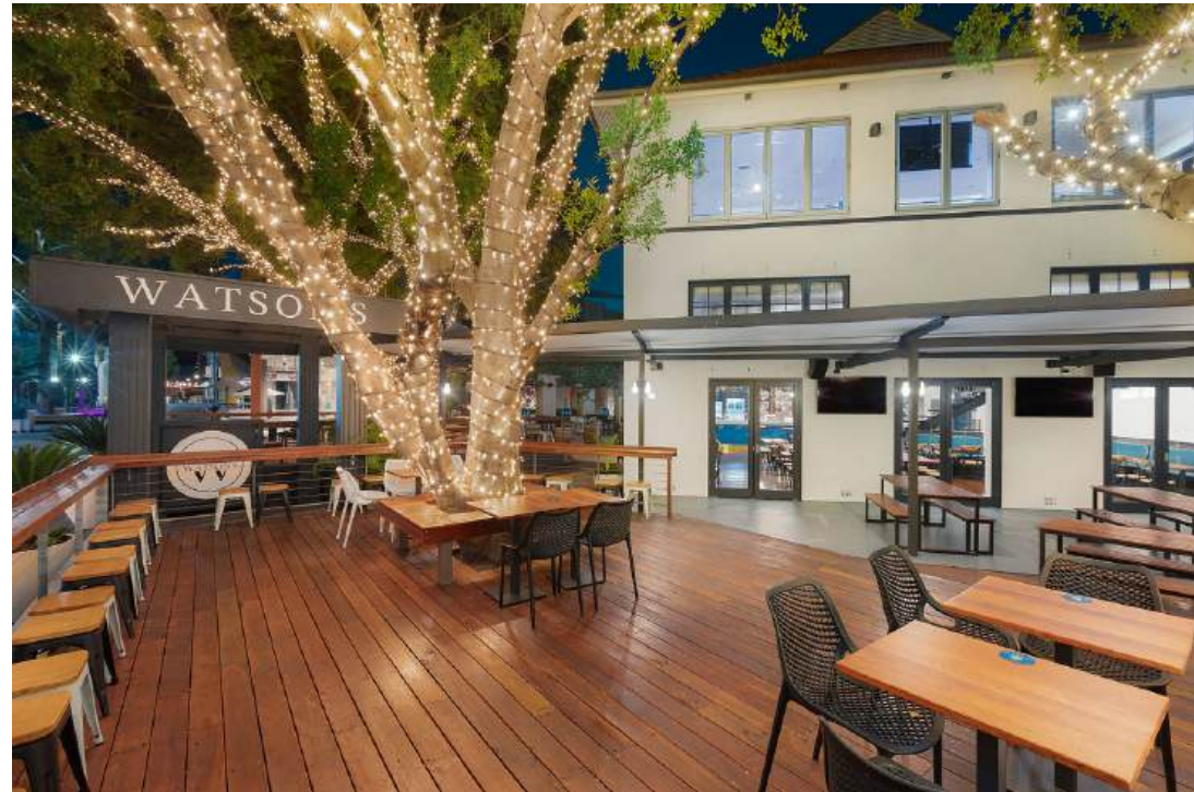
Cocktail area (up to 100 pax)

This space is available weather permitting